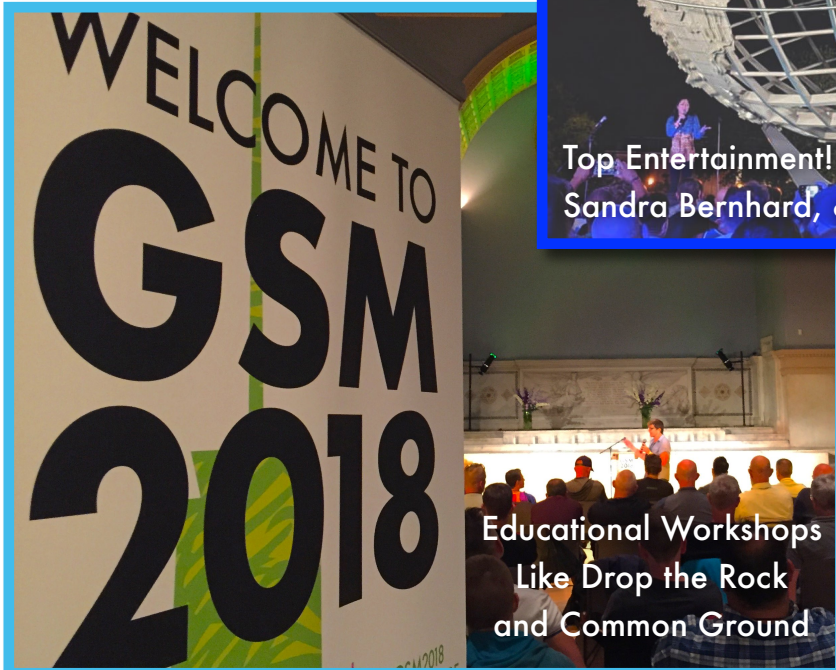
Educational Workshops Like Drop the Rock and Common Ground