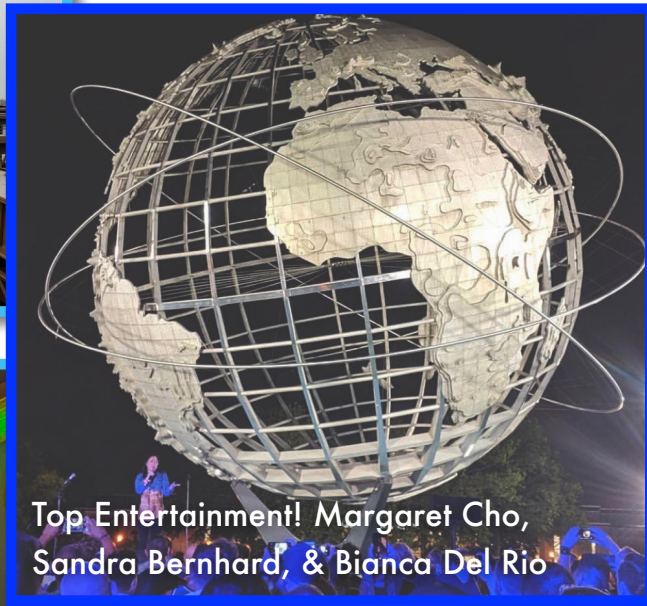
Top Entertainment! Margaret Cho, Sandra Bernhard, & Bianca Del Rio