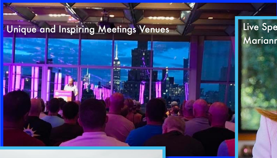
Unique and Inspiring Meetings Venues

The Gay & Sober Men's Conference is three days of meetings, health & wellness workshops, speakers, and fun activities devoted to gay men in recovery from alcoholism and drug addiction. A prime objective of the conference is to bring participants closer to one another. 500 - 600 attendees from all over the world.