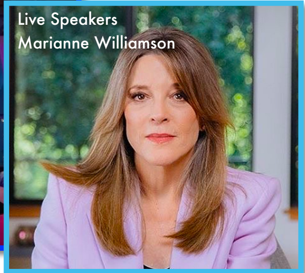
Live Speakers Marianne Williamson