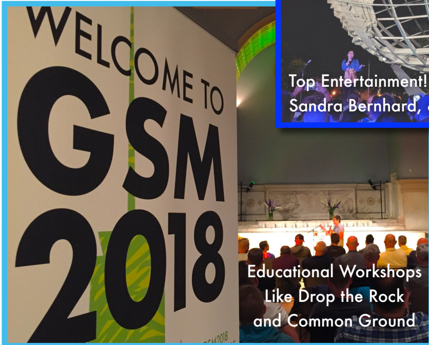
Educational Workshops Like Drop the Rock and Common Ground