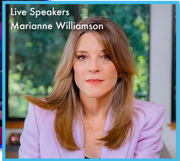
Live Speakers Marianne Williamson