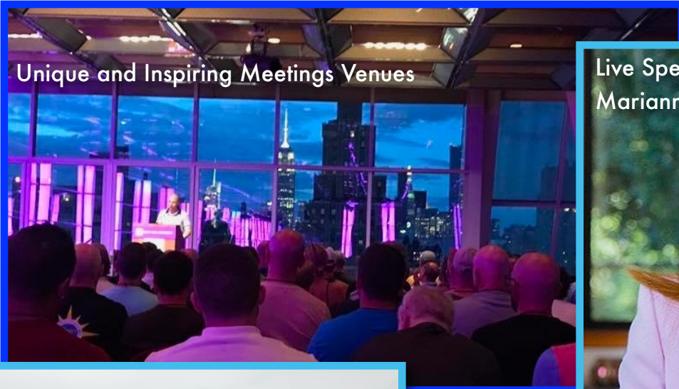
Unique and Inspiring Meetings Venues

The Gay & Sober Men's Conference is three days of meetings, health & wellness workshops, speakers, and fun activities devoted to gay men in recovery from alcoholism and drug addiction. A prime objective of the conference is to bring participants closer to one another. 500 - 600 attendees from all over the world.