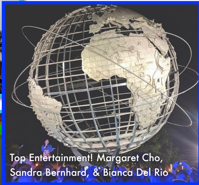
Top Entertainment! Margaret Cho, Sandra Bernhard, & Bianca Del Rio